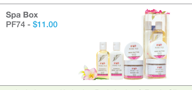
Includes 1oz Hydrating Body Lotion & Exotic Oil, 0.5oz Body Butter & 2oz Sugar Rub.