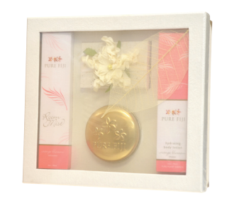
Island Bliss Set PF404 - $24.00

Transform your home into a tropical paradise with Pure Fiji's Island Bliss gift set. Perfect for any occasion, this gift has everything to pamper mind, body and soul. Includes a Handmade Soap, Luxury Tin Candle, 3oz Body Lotion and Room Mist.