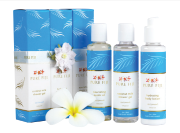
3 Pack Gift Set PF88 - $20.00

Includes a travel size 3oz Shower Gel, Exotic Oil & Hydrating Body Lotion.