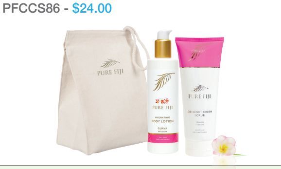
New Offerings for a New Year