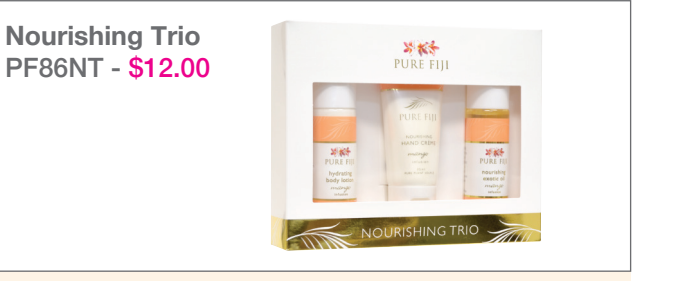
Includes 35ml Hand Crème, 1oz Hydrating Body Lotion & 1oz Exotic Oil

Available in Coconut, Mango, Starfruit, Guava and Noni infusions.