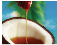
Coconut Milk & Honey