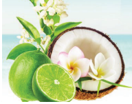
Coconut Lime Blossom